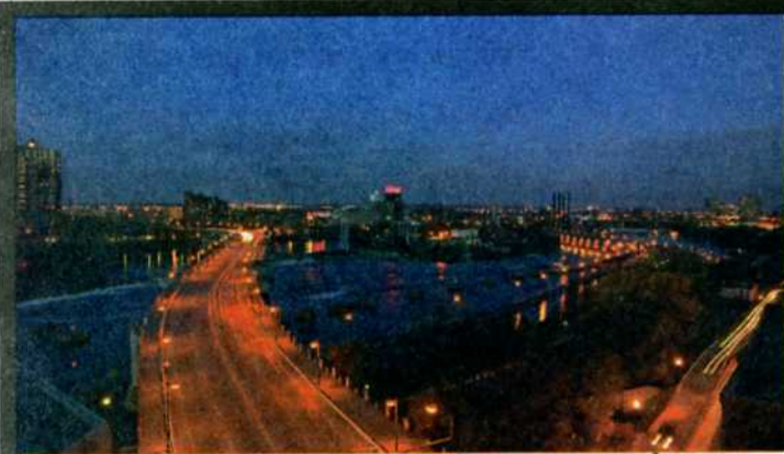
MAGNIFICENT RIVER OR CITY VIEWS

ONLY A FEW HOMES REMAIN! Soaring 39 stories above Minneapolis, the Carlyle offers one-of-a-kind amenities and views of the impressive downtown skyline or the beautiful Mississippi River. One, Two and Three Bedrooms from the $300s to the Upper Bracket Prices based on availability and are subject to change without notice.